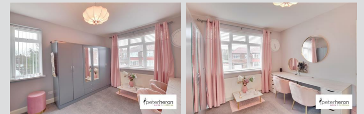
Bedroom 3 (front and side) 10'4" x 13'2"

UPVC double glazed windows to front and side aspects, single radiator.