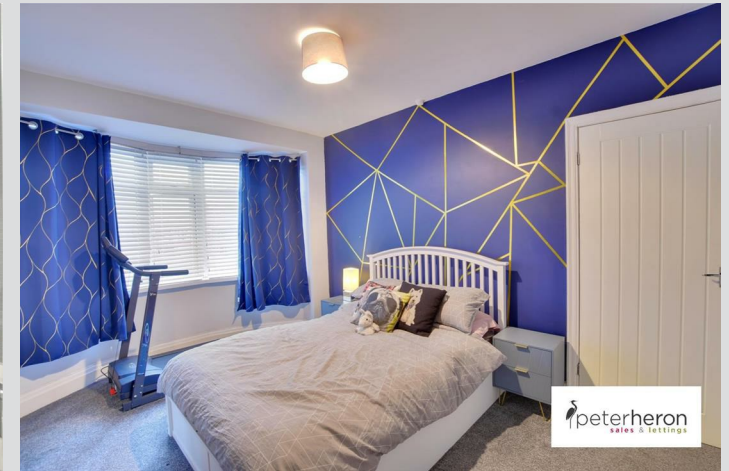
Bedroom 2 (rear) 11'7" x 14'7" inot bay

UPVC double glazed windows to rear elevation, fitted wardrobes with sliding mirror fronted doors, double radiator.