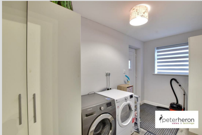
Utility 13'6" x 5'5"

UPVC double glazed window to front elevation, UPVC double glazed door to side, plumbing for washing machine, space for tumble dryer, built in cupboard discreetly concealing wall mounted gas combination boiler serving hot water and radiators, wood effect LVT flooring, door to shower room.