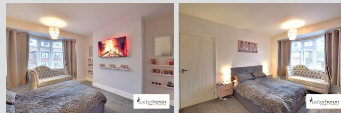
Bedroom 1 (front) 11'6" x 14'8" inot bay

UPVC double glazed window to front elevation, double radiator.